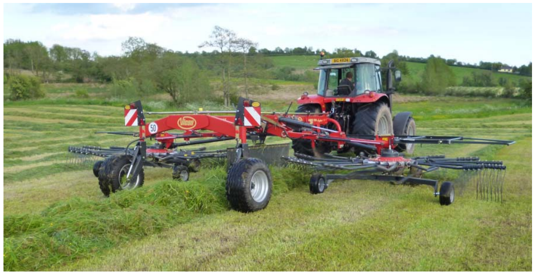
The new Andex 904 Hydro

With 9m working width and transport height below 4m, even without detaching tine arms, the new Andex 904 Hydro offers remarkable productivity with no downtime.