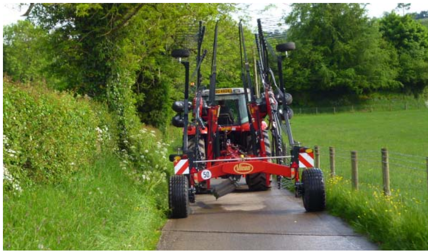
Below 4m transport height, even with tine arms mounted.

The infinitely adjustable cam track allows fine tuning to all crop conditions in order to obtain optimum raking and swath formation.