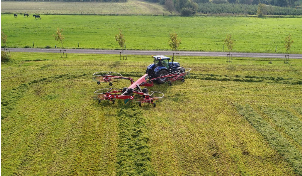
Individual lifting of all four rotors