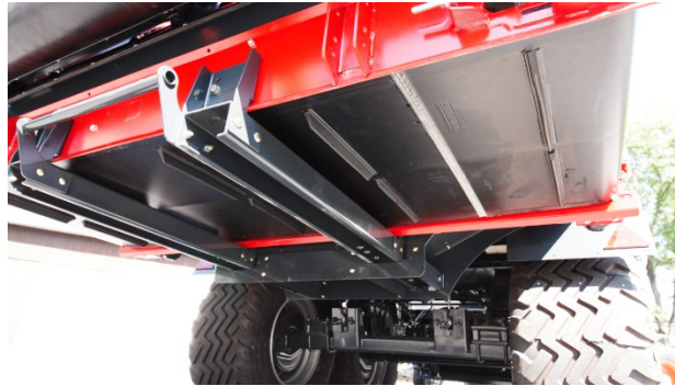
Robust undercarriage for transport and/or when using as common loader wagon.

Number of Characters (with spaces) in Text and Main Heading: 306