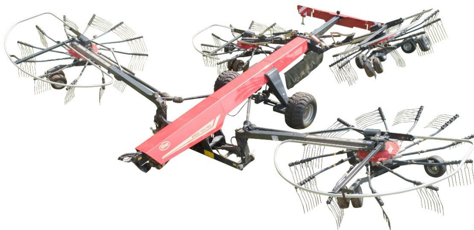
Individual lifting of all four rotors

Whereas the Andex 1304 is already equipped with standard features like separate front and rear rotor lift, very simple electronic control, high performance oil bath gear box, hydraulic adjustment of working and swath width on front and rear rotors, the 1304 PRO is additionally equipped with new solutions for becoming even more efficient.